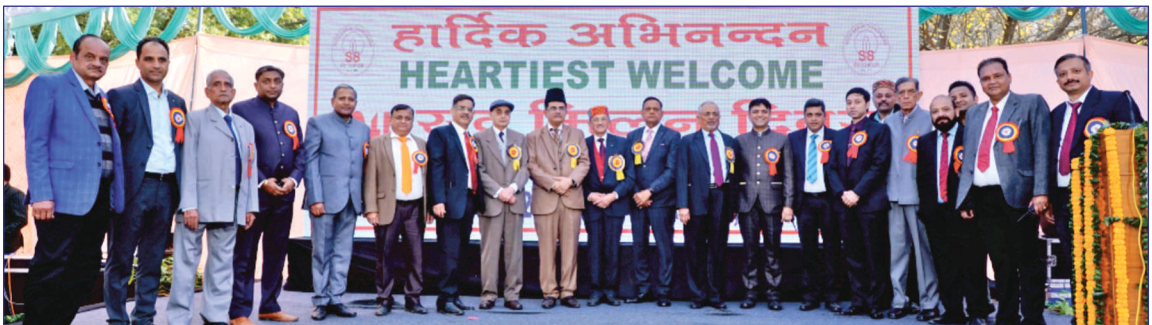
Members of Executive Committee of Sood Sabha Chandigarh with the Chief Guest.