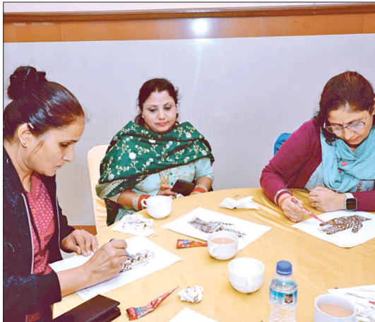
Mehendi Competition Participants and their work