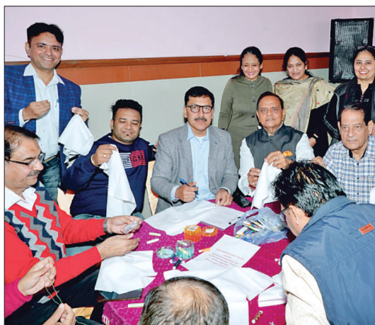
Button Stitching Competition for Gents.