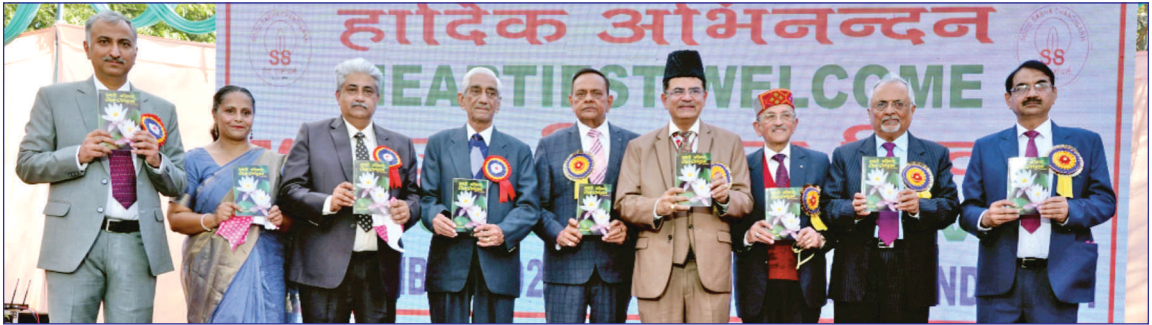
Releasing of Book "Our Origin - हमारी अस्मिता" by the Chief Guest.