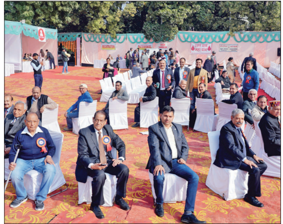
Seniors Enjoying musical chair.