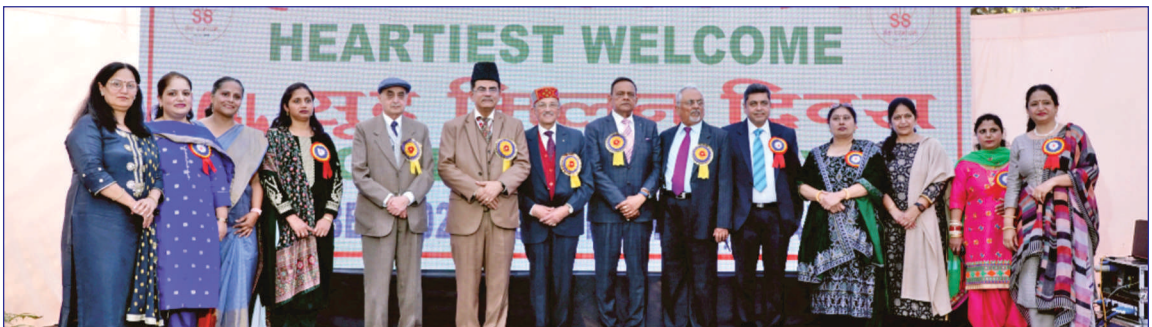
Lady Executive Members of Sood Sabha Chandigarh with the Chief Guest.