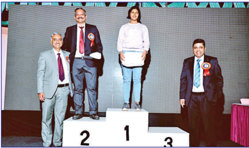
Winners of Events