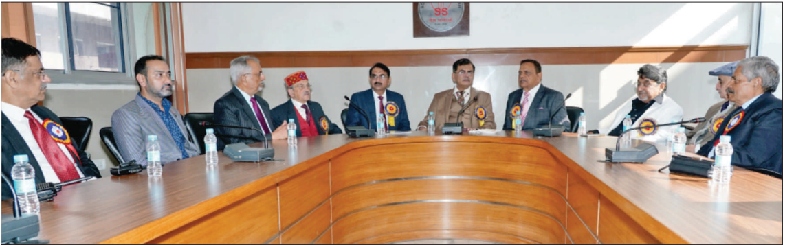
Members Meeting with the Chief Guest.