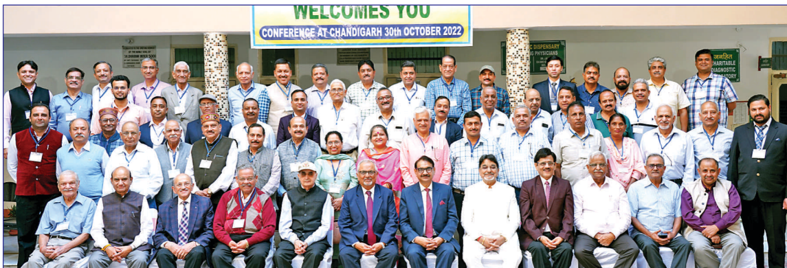
Delegates of Sarvadeshik Sood Sabha Conference.