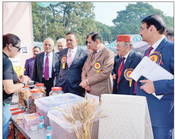
Chief Guest having round of the stalls.