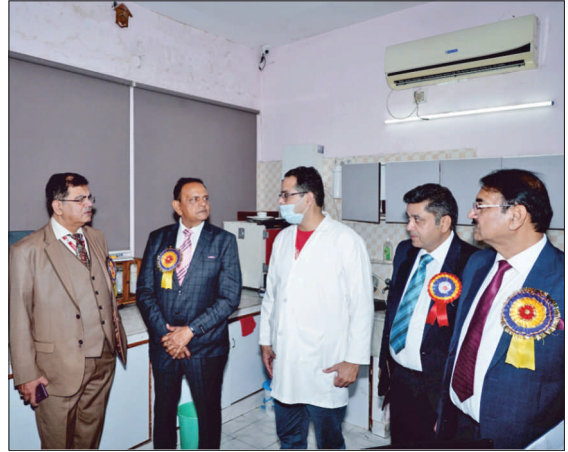
Chief Guest visiting the Diagnostic Lab.