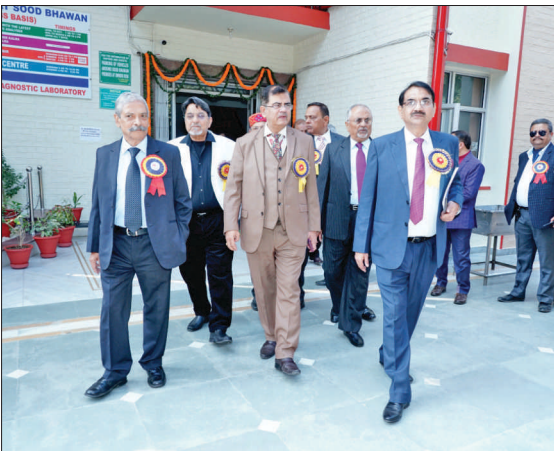
Chief Guest being escorted to the pandal.