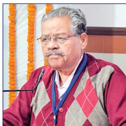
Justice (Retd.) Arun Goel