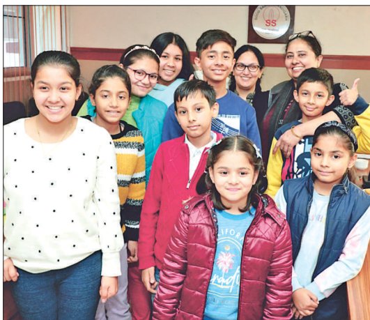
Card Making Competition Participants and their work