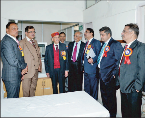
Chief Guest visiting the Physiotherapy Lab.