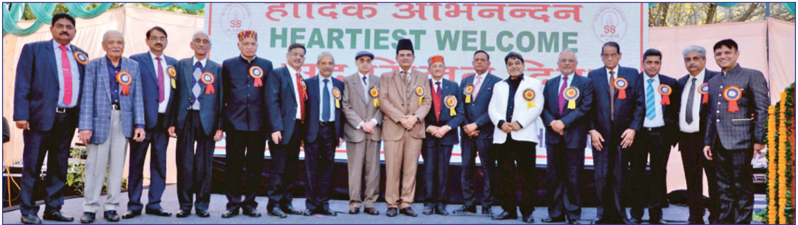
Office Bearers of Sood Sabha Chandigarh with the Chief Guest.