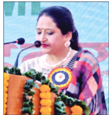
Our Compering Team