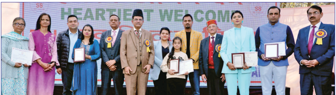
Honouring of achievers in various fields.