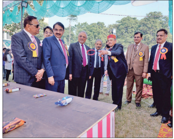
Chief Guest and Guest, trying their luck at the stalls.